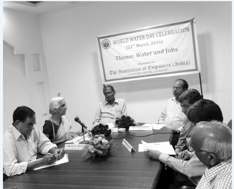
Guest of Honour delivering the Lecture

'World Water Day' is celebrated every year on 22nd March for awareness to engineering fraternity about conservation and optimum use of Water in Agriculture and Industrial sector along with the general public, in accordance with the directives and decision taken by UNO in 1992. Accordingly this year too 'World Water Day' was celebrated on 22/03/2016 at the Institution of Engineers (India), UP State Centre premises.