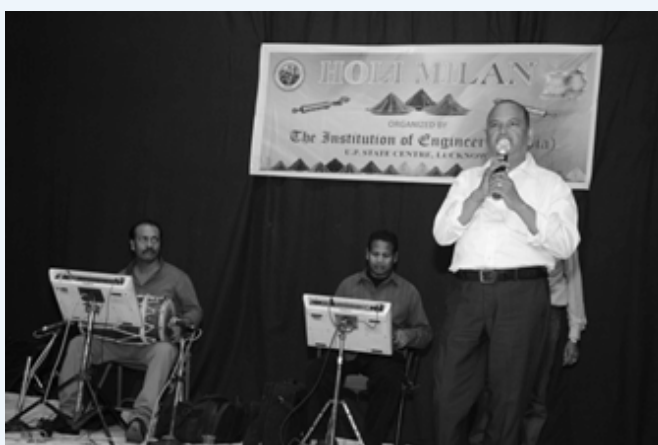
A view of the cultural programme during celebration